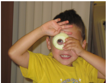
Participant during an apple themed story

The Ogden Library's Summer Reading Program's "One World, Many Stories" theme was a popular one this summer. We had 289 children registered in the reading programs. 918 children attended a number of summer events. 58 young adults participated in the reading program and a total 380 teens attended the programs. Our most popular program every year is the Tie-Dye. Almost 300 people, young and old, showed up to dye t-shirts. 18 patrons took part in the adult reading program and entered the weekly prize drawings.