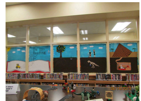
Painted for our summer reading program

We revamped and improved our website to make it easier to find all the items you need to know what's available and what's happening at your library. Check it out at http://www.ogdenlibrary.com