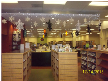
The library decorated for winter