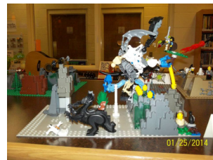
A fine example of our LEGO® club